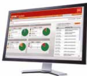
LIFENET® System / CODE-STAT™ Data Review Software