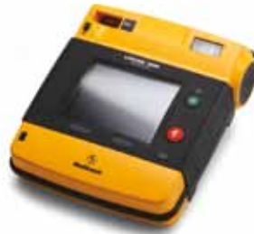
LIFEPAK® 1000 Defibrillator