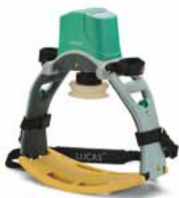
LUCAS™ Chest Compression System