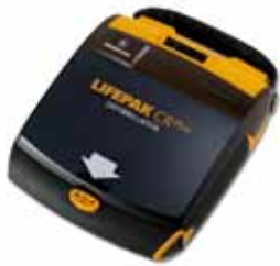
LIFEPAK CR® Plus Automated External Defibrillator