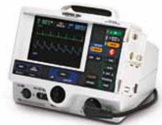
LIFEPAK® 20e Defibrillator/Monitor